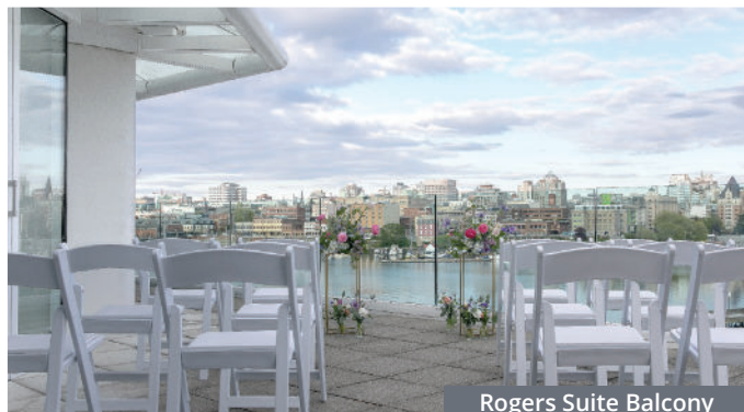
Rogers Suite Balcony

A minimum non-refundable deposit of $1500 must be received with your signed agreement to confirm your wedding date. Further deposits of $4000 9 months prior to your wedding, and $4000 4 months prior to your wedding will be required.